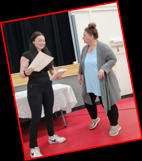
Award of Merit for ELA