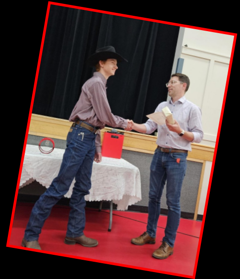
Award of Merit for Science