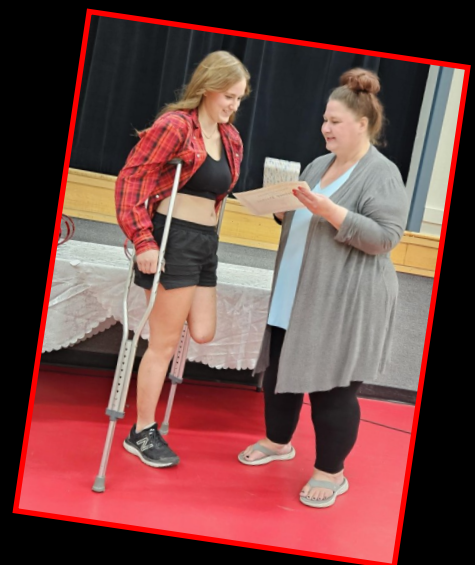
Award of Merit for History