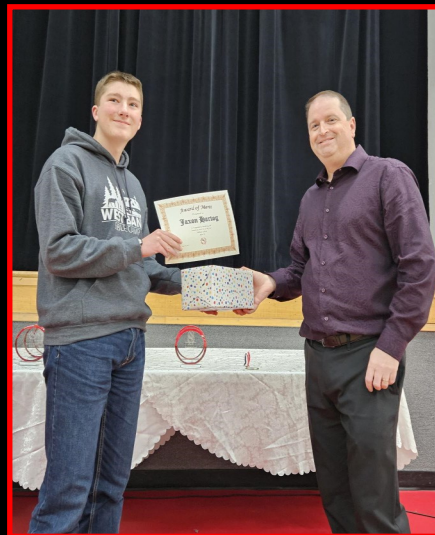
Award of Merit for SaskDLC