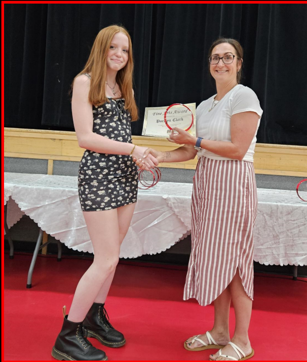
Fine Arts Award Division III