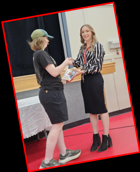
Award of Merit for Arts Ed