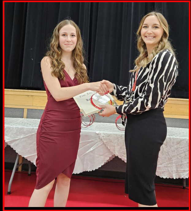
Fine Arts Award Division IV