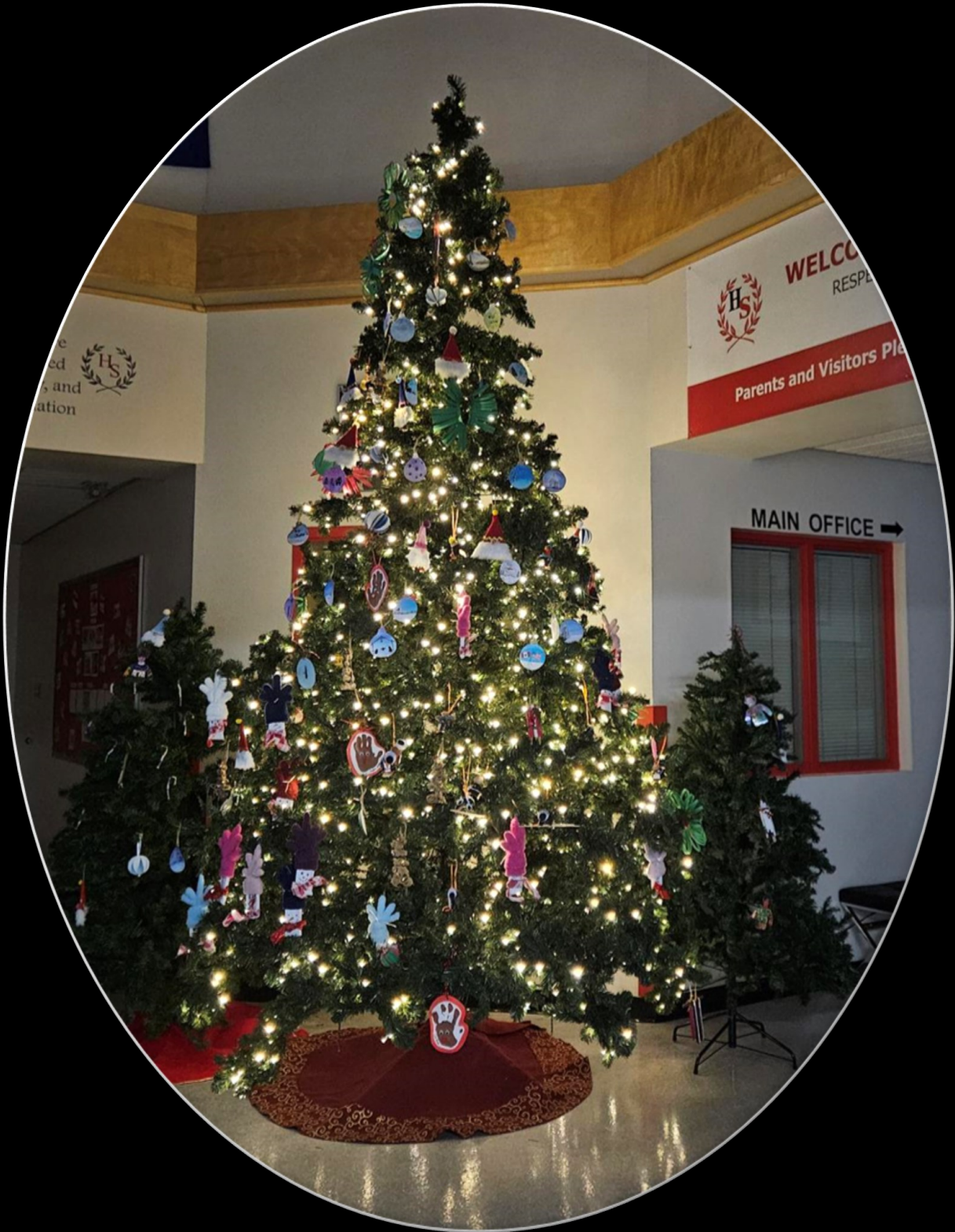
Christmas at Herbert School