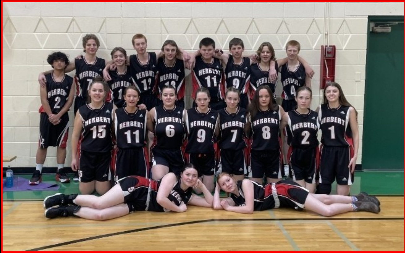
Sr Girls' and Sr Boys' Basketball Teams for 2024-25