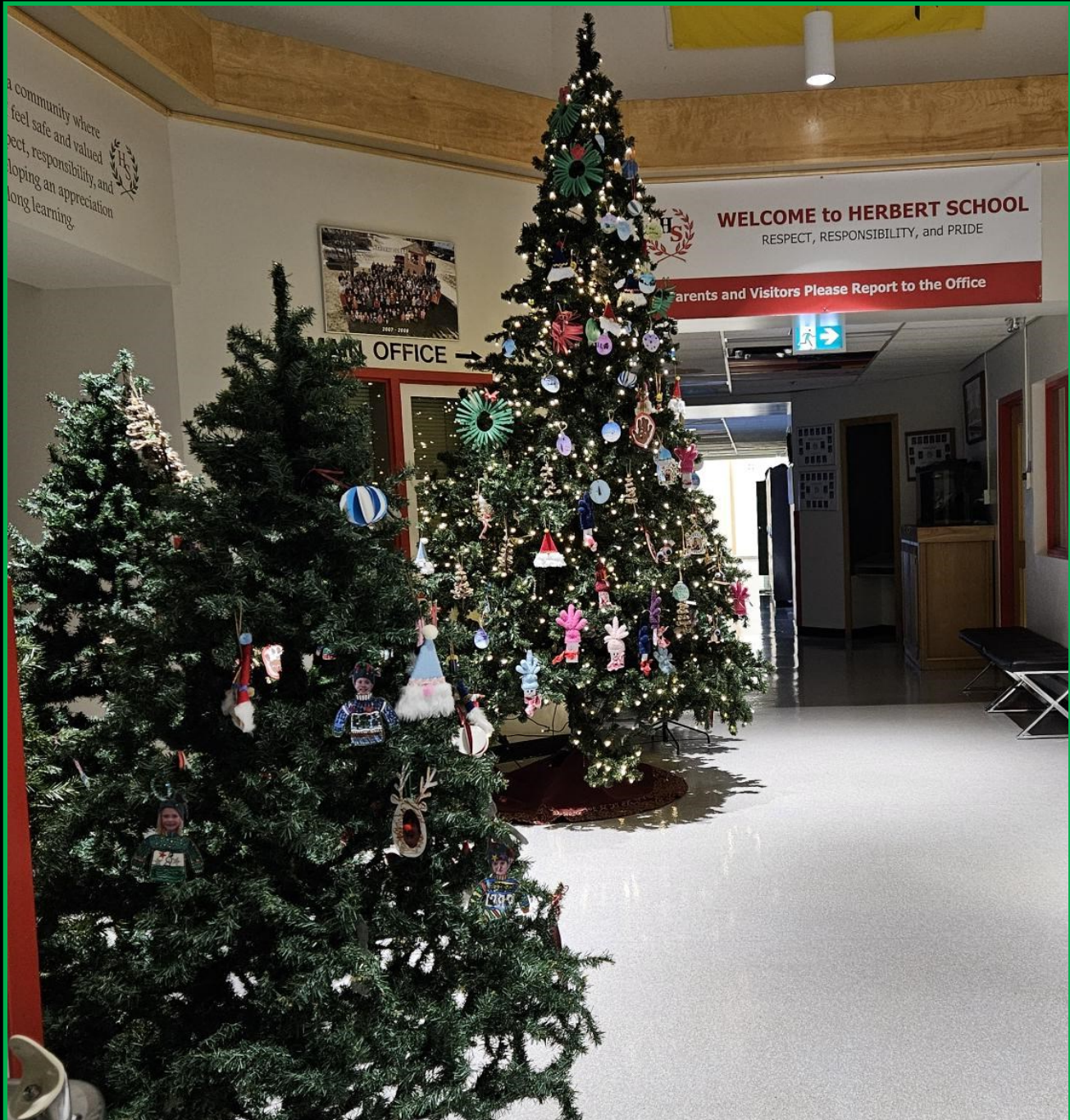
Christmas at Herbert School