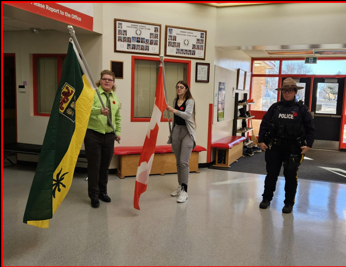
Remembrance Day Service November 7th, 2024