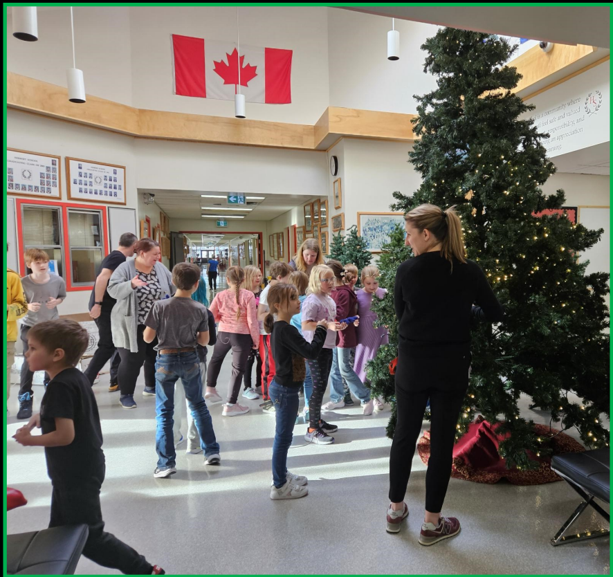
Decocarting the Christmas Trees