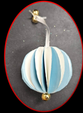
Some of our Christmas Decorations created by students!