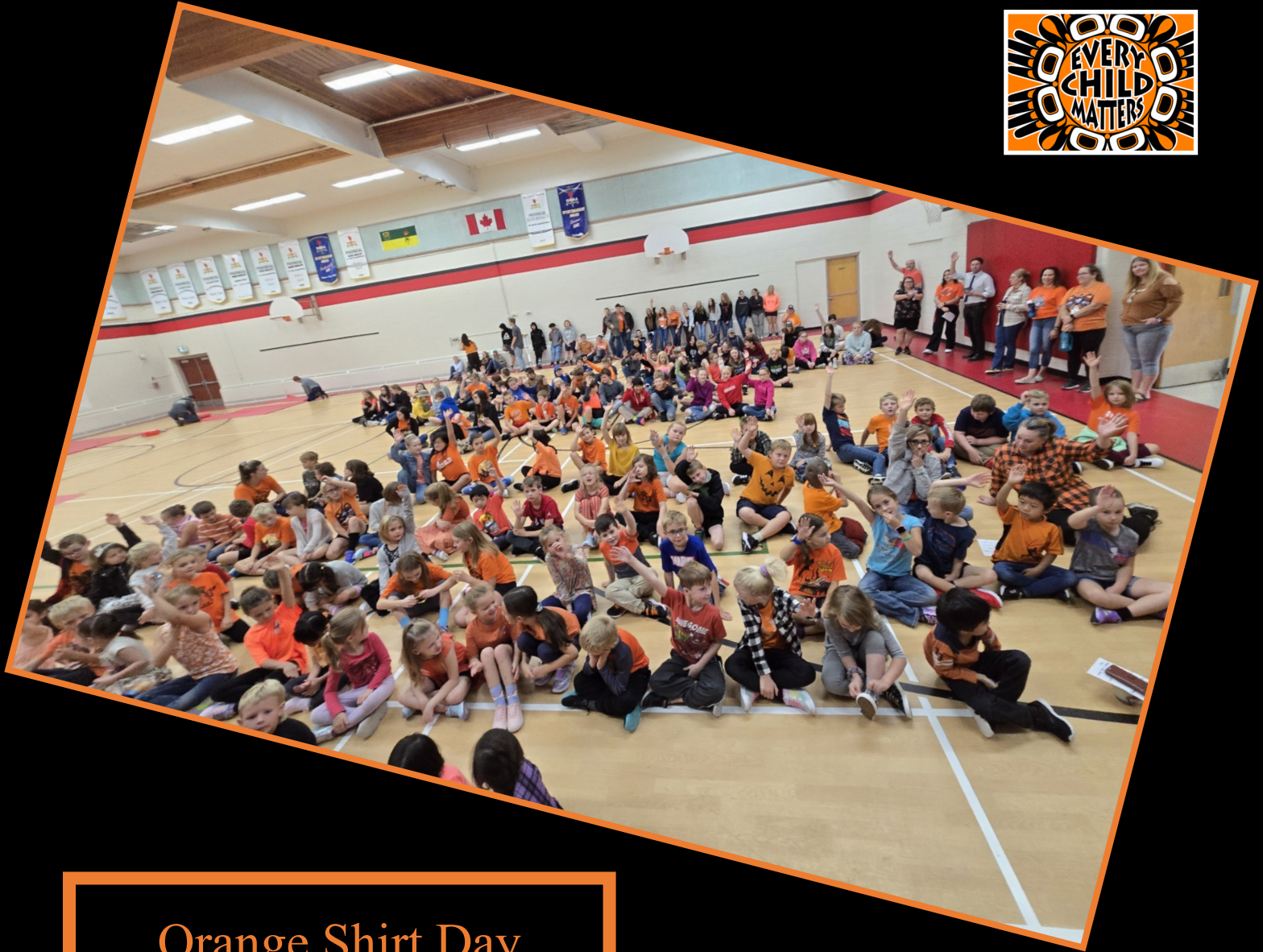
Orange Shirt Day September 27, 2024